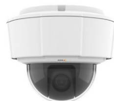
Contemporary high resolution IP camera capable of image tracking and zooming

The current generation of IP-based video surveillance systems was introduced in the late 1990's and differs from the earlier approach in several ways. Relying on natively digital rather than analog technology, the image quality of the IP cameras used by the new systems has been dramatically improved, with current IP cameras able to deliver up to 20-megapixel resolution compared to the previous maximum of 0.4 megapixels with analog cameras.